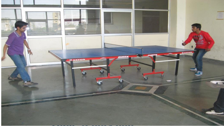
Table Tennis Hall